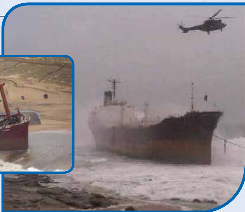
South Africa July 2011