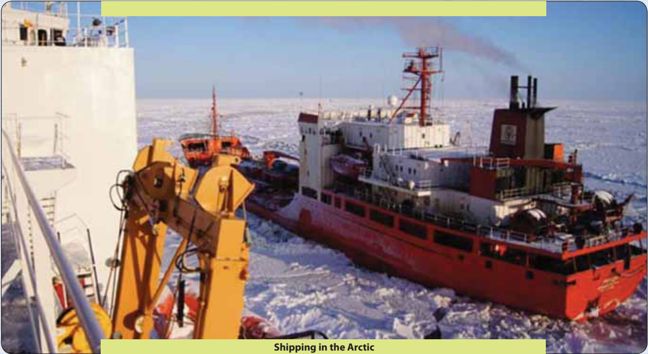
Shipping in the Arctic