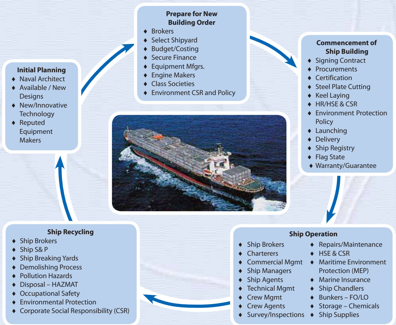
LCA Factors and Recycle Diagram

Effective waste management plan and strong CSR/HSE policy for vessel demolishing, could be a significantly lucrative return on investment sector of the maritime industry.